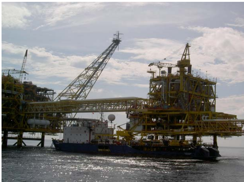
DSV Team Siam is performing riser clamp installation