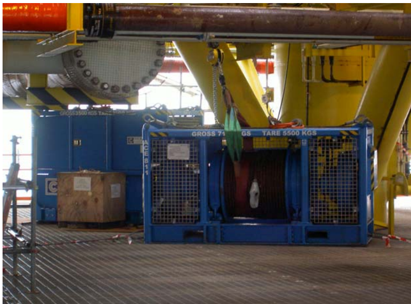
Winch and power pack on the platform deck for riser installation